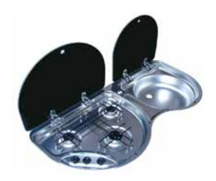
040853 SMEV 3 HOB AND RH SINK COMBO 3 Burner - Tap Sold Separately - Glass Lid