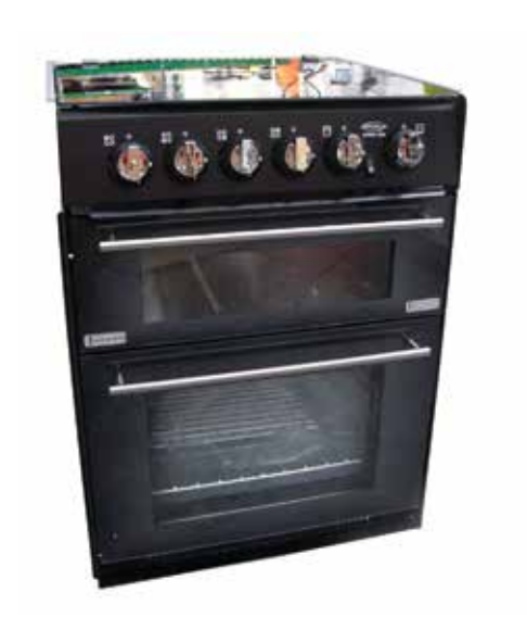
041809 CHARCOAL Chrome Knobs with T Bar Styled Handles With Oven Light