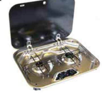
040321 SMEV 2 HOB With Flush Mounted Glass Lid