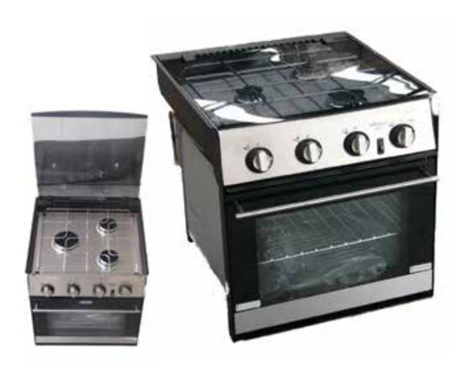
041811 TRIPLEX Rapid 3 Burner with Grill and Oven Satin Knobs