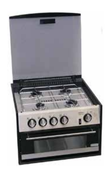
041810 MINIGRILL 4 Burner with Grill Satin Knobs