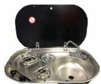
040394 SMEV 2 BURNER HOB AND RH SINK COMBO 2 Burner - Tap included - Glass Lid