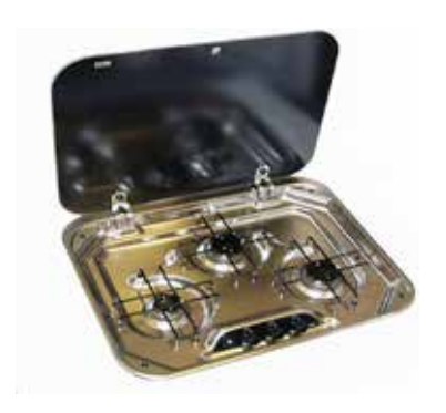
040393 SMEV 3 HOB With Flush Mounted Glass Lid