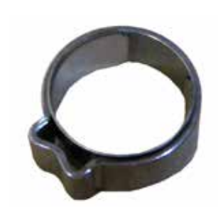
Gas Clamp 002726