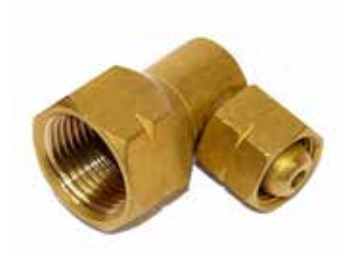
GASMATE 3/8"BSP cylinder valve to a POL outlet