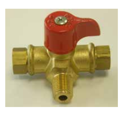
2 Way Gas "T" Valve000143 Valve Sold Separately