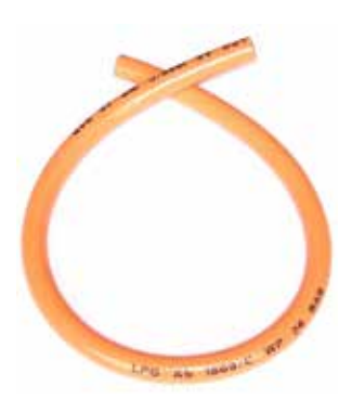
LPG HOSE ( Per Metre) 001407 8mm (5/16")